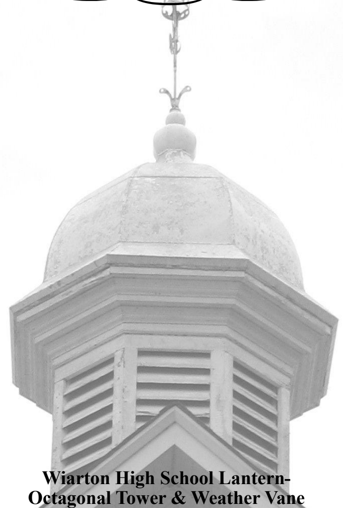
Warton High School Lantern- Octagonal Tower & Weather Vane