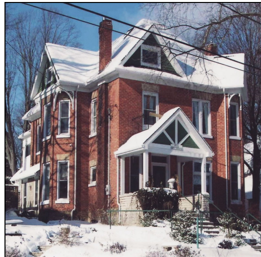
The “James Symon” House