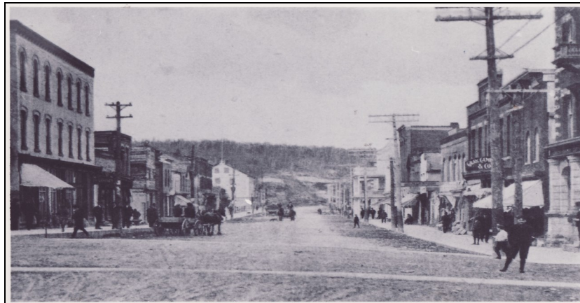
Early view of Berford St. looking north