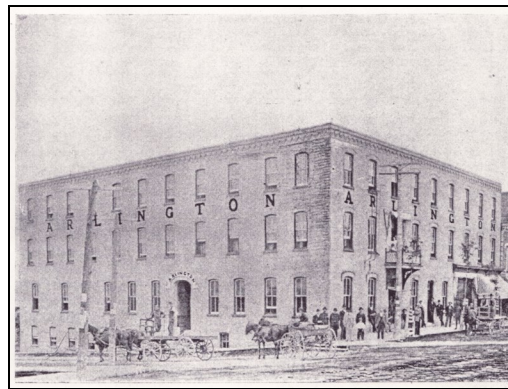
The Arlington Hotel, circa 1930