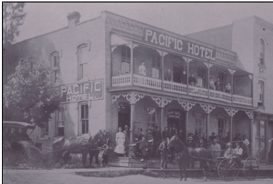
The Pacific Hotel, circa 1885