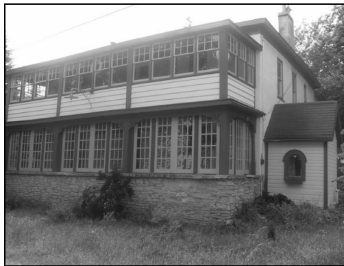
The Anchor Inn