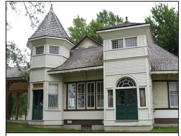
The Wiarnton Train Station