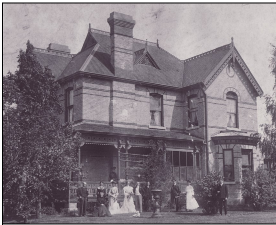
“Fairbairn” House, circa 1886