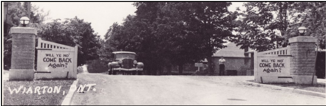
The Wiarthon Gates, exiting, circa 1942.

The first wharf was built in 1868. Mills started up and commerce began to boom with business relocating down to Berford Street leaving Gould Street to become strictly residential. The first train arrived in town November 29 th , 1881, opening a much larger market for industry and tourism. The resulting growth allowed for the incorporation of this village with a population 400+ in 1880, to a town in 1894 population 2000+. By 1891 telephone service was established in Wiarthon, just 13 years after the first exchange in the British Empire was opened.