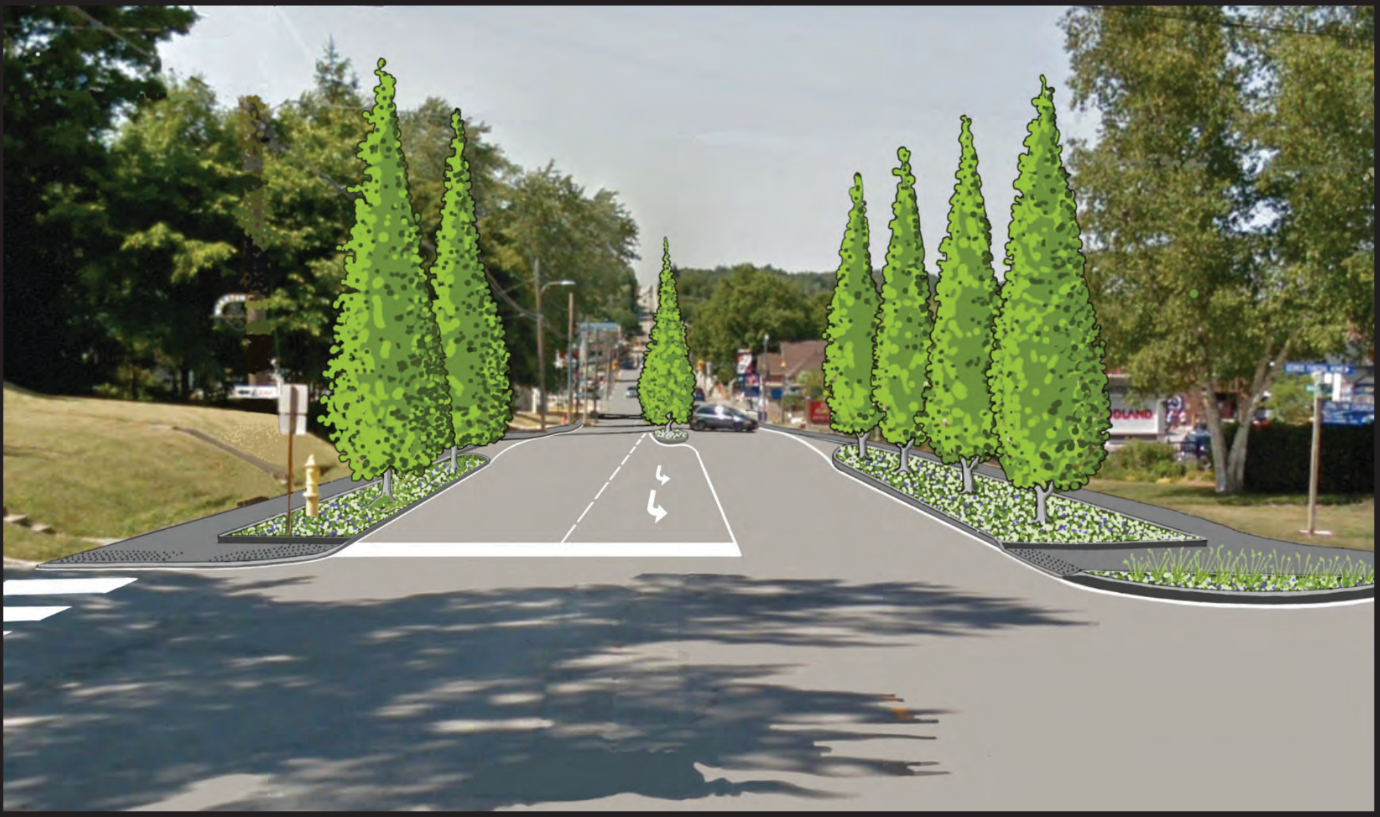
Berford Street at Mary Street, looking North