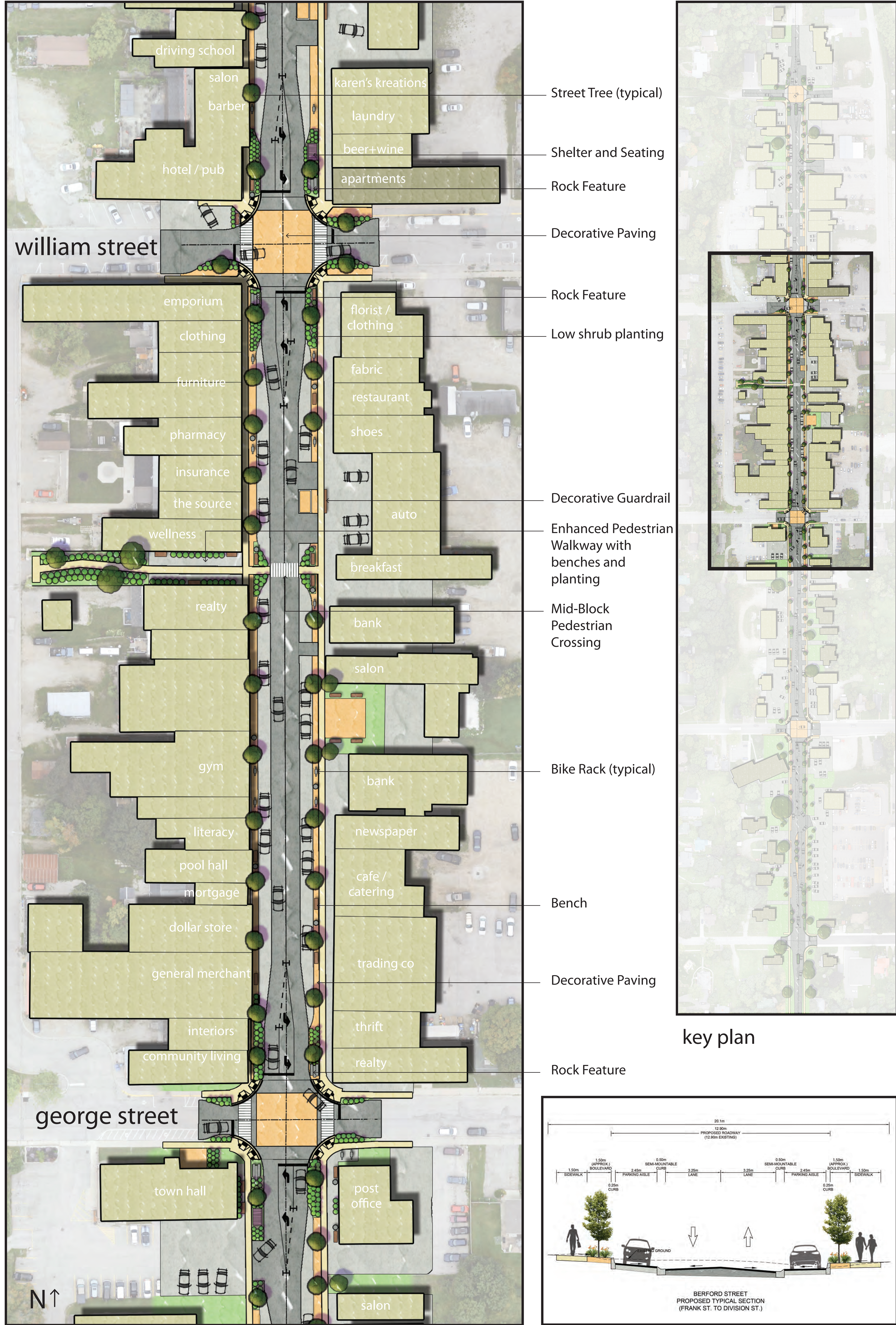
Berford Street typical section